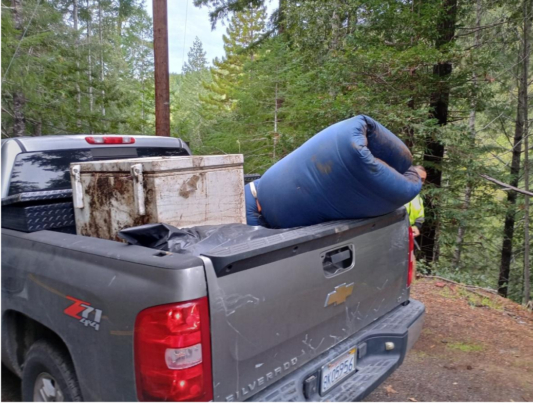
Mountain View Rd