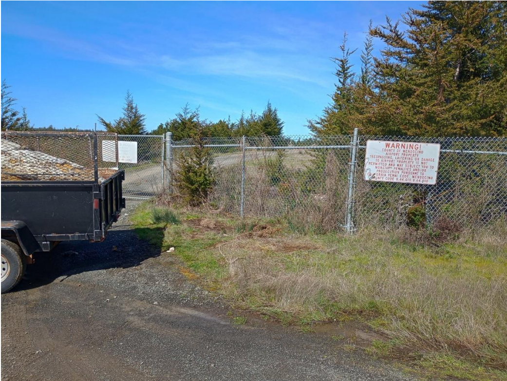
Albion/Little River Rd