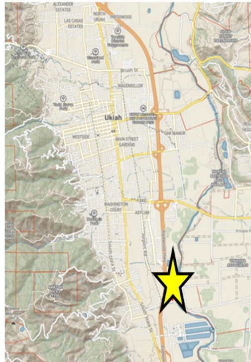
Site Location in Ukiah