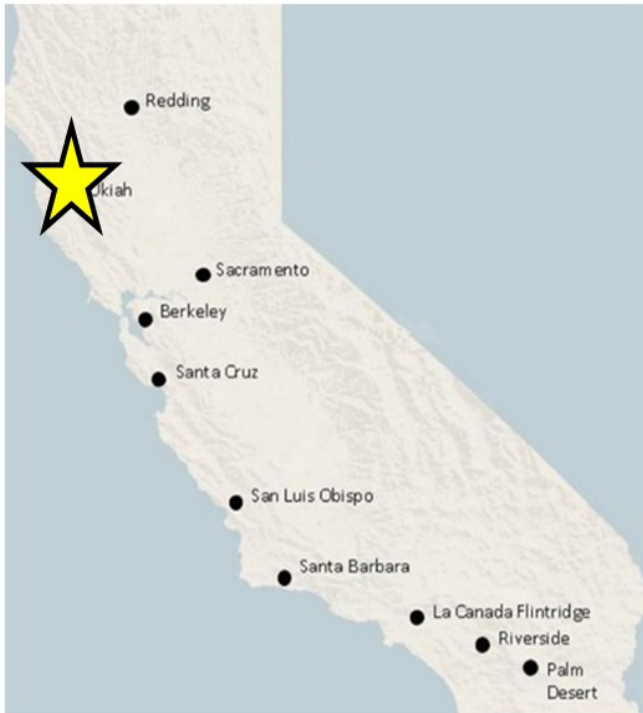
Site Location in State