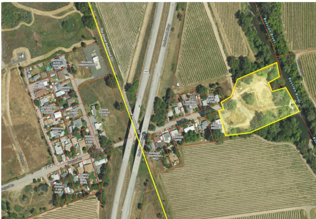
Site Location in Relation to Great Redwood Trail